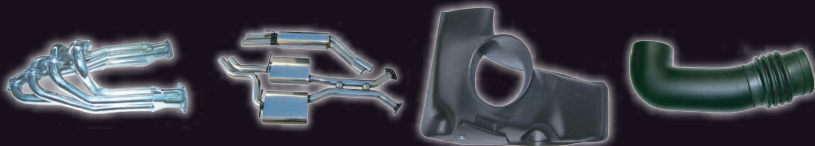
4-1 Extractors Twin 2.5" Exhaust Cold Air Intake 4" MAF Pipe